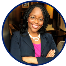
Michelle Cooper U.S. Department of Education